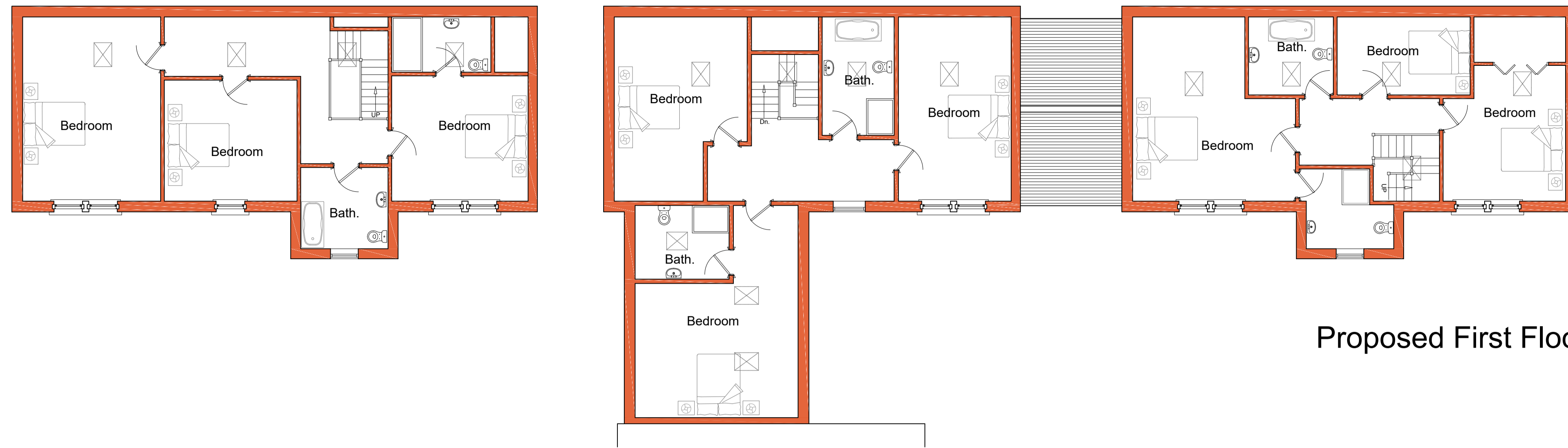
Proposed First Floor (New Build Section)