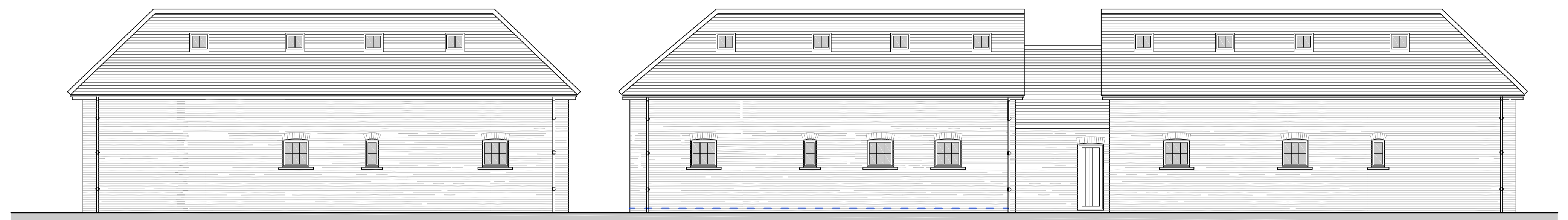
Proposed North Elevation (New Build Section)